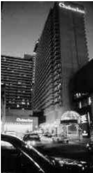
The Delta Chelsea Toronto Hotel