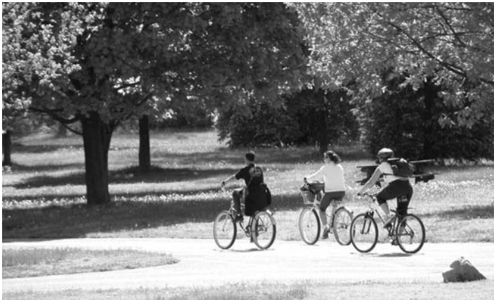
Village Patio Toronto Island Cyclists

Toronto is recognized as the most multicultural city in the world, thanks to a few decades of large-scale immigration of Italians, Chinese, Greeks, Vietnamese, Jamaicans, Somalians, Indians, and others. This has led to a richness of cultural neighbourhoods and international cuisine. There has been rapid gentrification of some neighbourhoods since the APA was last in Toronto - a great example is the West Queen West Art and Design District. It is worth a walk along Queen Street West, from Bathurst all the way out west to visit the refurbished hotels in Parkdale; the Drake Hotel and the Gladstone Hotel (at Beaconsfield and Gladstone Avenues, respectively).