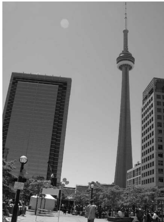
Toronto Space Needle