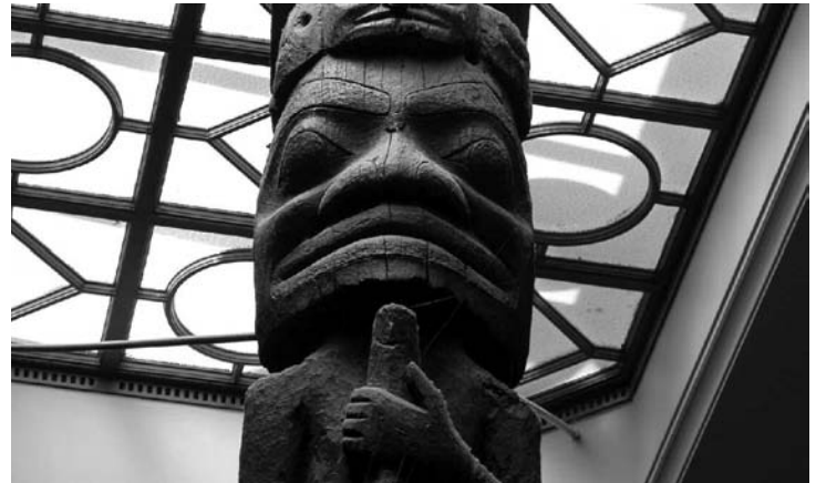
Royal Ontario Museum Totem