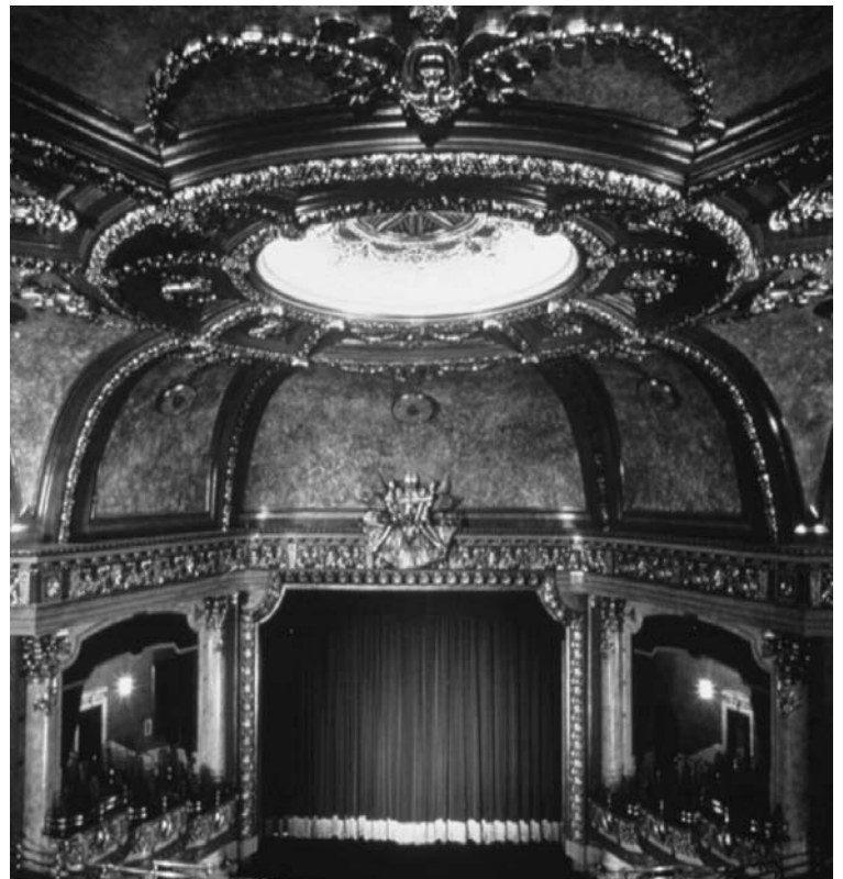
Elgin Winter Garden Theatre, Toronto, Canada

* Member-In-Training, General Member, Fellow, Life Member, Life Fellow