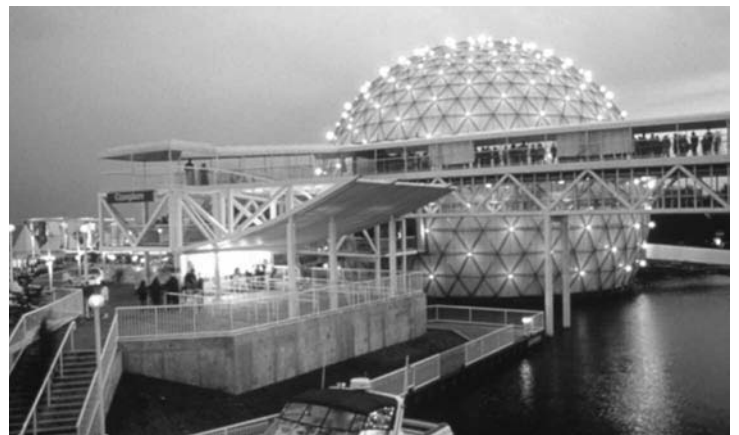
Ontario Place, Toronto, Canada