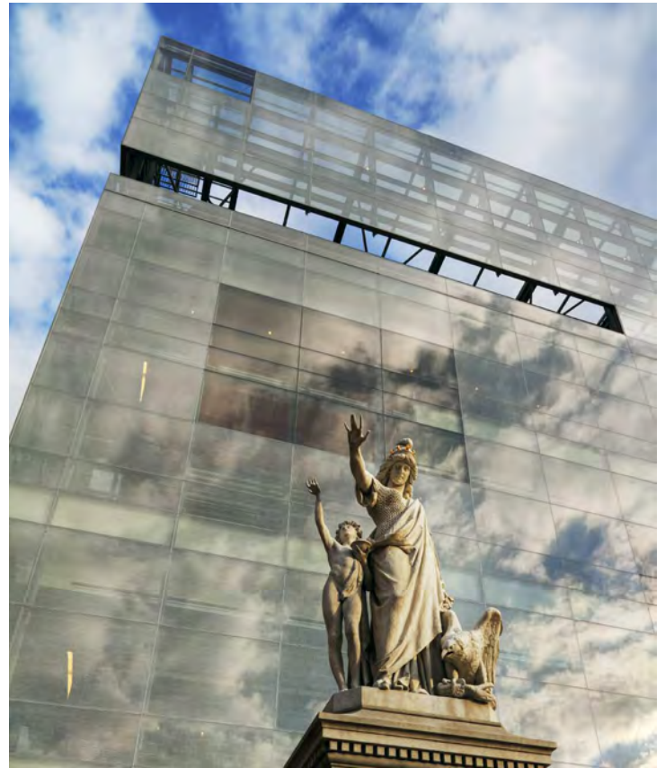
View of "Religious Liberty" sculpture in front of the Museum's glass façade

The design of the National Museum of American Jewish History's new building has been informed by the idea that freedom is the essential humanizing value of American democracy and, thus, central to the narrative of Jewish American life. Facing Independence Mall is a glass prism expressing the openness of America, as well as the perennial fragility of democracy. Built at a cost of $150 million, the five-story, 100,000-square-foot space includes 25,000 square feet of exhibit space, an 85-foot-tall atrium and a 200-seat theater. The terra cotta and glass building is topped out with a beacon of light meant to symbolize themes of faith and patriotism.