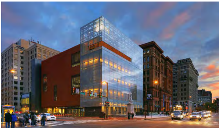
National Museum of American Jewish History (dusk), © Jeff Goldberg/Esto, courtesy of National Museum of American Jewish History.

Our Annual Awards Reception is in the brand-new National Museum of American Jewish History (101 South Independence Mall East, Philadelphia, PA 19106 • http://www.nmajh.org/ ) on the Fifth Floor Terrace overlooking Independence Hall and the Mall. There will be Hors d'oeuvres, Wine and Beer served from 7:00pm, with the Awards Ceremony starting at 8:00pm. There is no admission charge for the event. The museum is a 10-minute walk from the Loews Philadelphia Hotel (the AGLP host hotel) or a two-minute Subway ride (Blue Line) down Market Street. The Fifth Street stop of the Subway is on the corner in front of the museum.