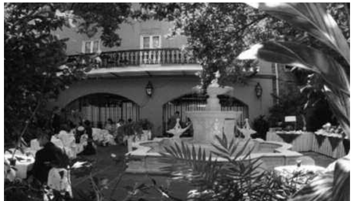
The courtyard of the Hotel Mason Dupuy in the French District of New Orleans, AGLP's host hotel.