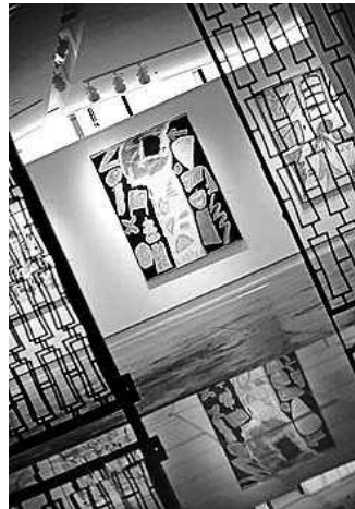
Art Gallery of the Renaissance Arts Hotel